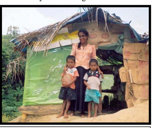
Aug. 24<sup>th</sup>: Near Ratnapura, in the rainy central jungles of Sri Lanka, a woman and her two children in their home, built from cardboard, paper, and tarps.

didn't have much use for rupees in America, and 4,200 rupees is a pretty big hunk of cash in Sri Lanka. So I