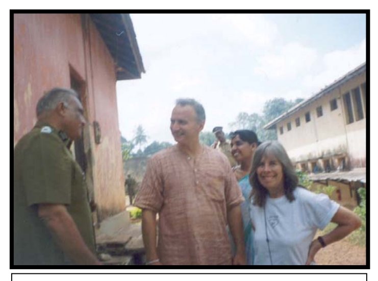
Aug. 24th: Here we are with the warden of Mahara Prison, a good man.

Although Sri Lanka continues to sentence people to death, no execution has been carried out since 1976. In my public lecture, I encouraged the people of Sri Lanka to go ahead and make it official that they have banned the death penalty